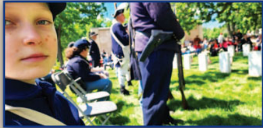
J. G. Armstrong Camp #49, the Rosechal GAR Hall