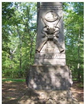
Figure 1: Chickamauga (Left) & Shiloh (Right)

Battlefield visitation, along with readings of the battle's history or memoirs, can really help your full understanding of what occurred at the site and the topographical elements which affected commanders' decisions as well as the ebb and flow of battle. I recall visiting the Pickett's Mill battlefield to the west of Atlanta (a state park) and seeing the deep ravine that Union soldiers were trapped in while the Confederates under General Hiram Granbury fired down into the ravine. Seeing it in